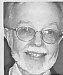
and Brazil (Stanford, 1996), and Liberalization